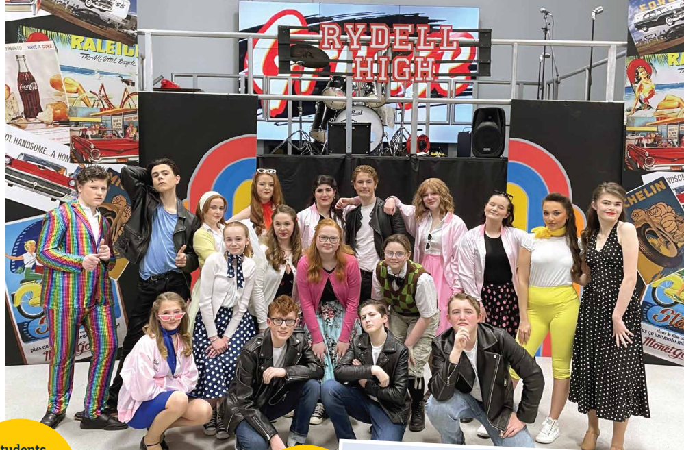
Students perform Grease to sell out audiences

Recent school productions, including Oliver!, and Grease, have been the most inclusive productions that we have held for years, with students showcasing their talents with high quality acting, singing and dancing.