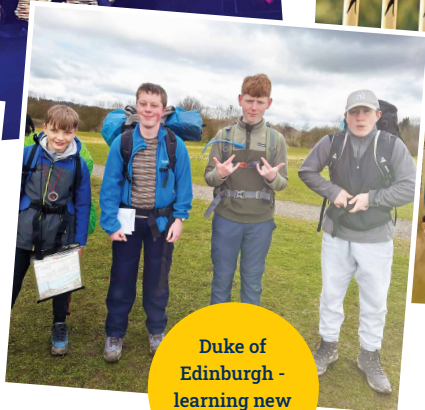
Duke of Edinburgh - learning new skills